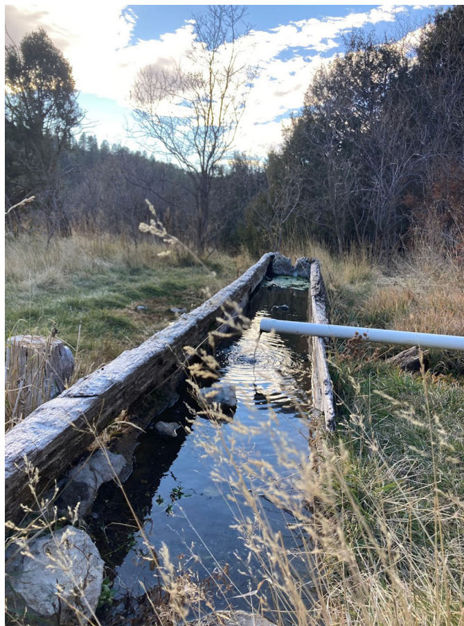
Hollowed out log water trough typical at Kaibab Plateau Springs