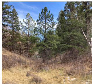
A typical Kaibab Plateau wet meadow

Guests may check-in to the cabins at 4:00 PM. Some may not have cellular service after Jacob Lake.