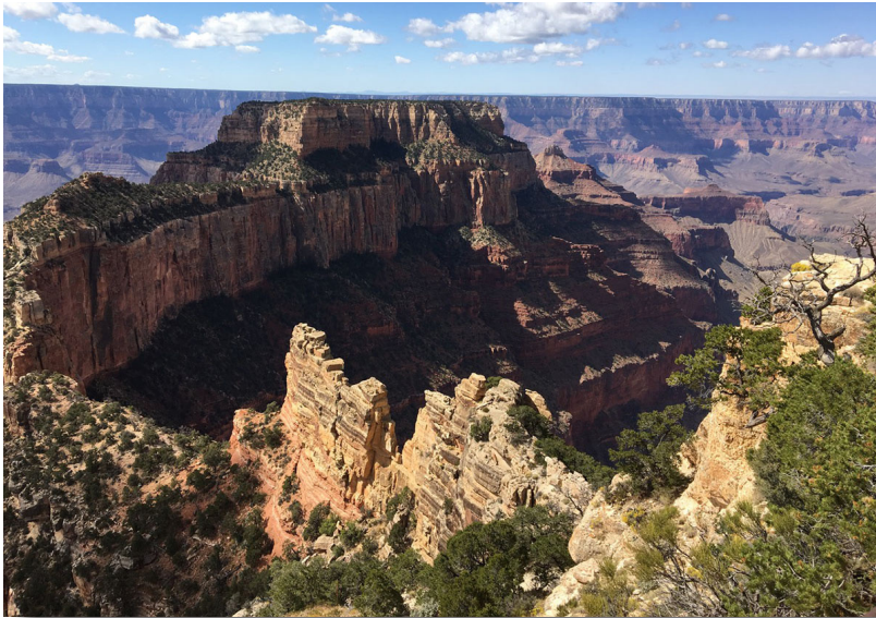
View of Wotans Throne from Cape Royal by Robert Balcells