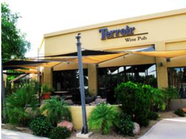
Terroir Wine Pub