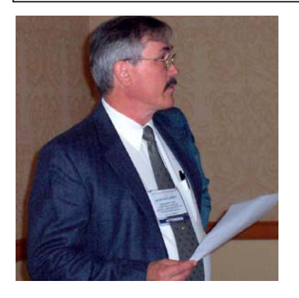
More information about these winners will be reported in the next newsletter.